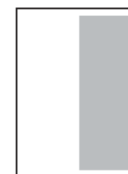
1/2 VERTICAL Live Area 3¾" x 10"