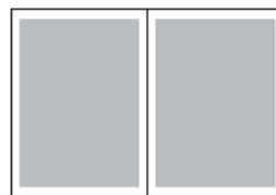
2-PAGE SPREAD Live Area 15" x 10" Bleed 16½" x 11" Trim 15¾" x 10¾"