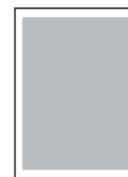
FULL-PAGE Live Area 7" x 10" Bleed 8½" x 11" Trim 7¾" x 10¾"