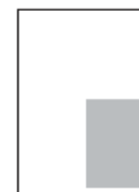
1/4 VERTICAL Live Area 3¾" x 4¾"